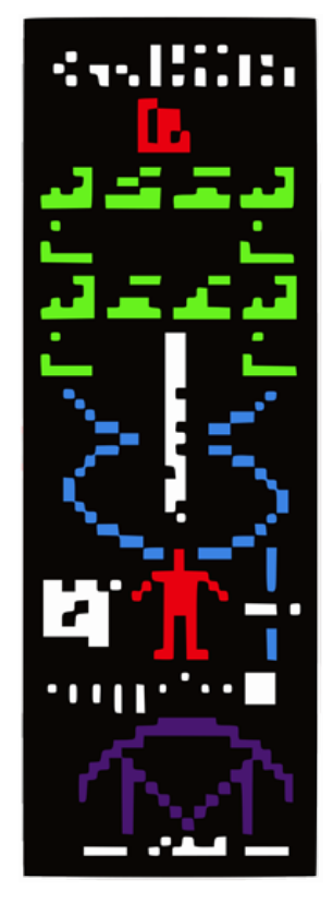
Figure 3. The binary code "Arecibo Message" beamed toward the globular cluster Messier 13 at a ceremony for the remodeling of the Puerto Rico Arecibo Telescope on November 16, 1974.

sage" and was beamed toward the M13 globular cluster 22,000 light years distant. It contained encoded data including the Earth's position in the Solar System, and information on the human race and DNA. This was followed in 1976 with design work to develop the "Voyager Golden Record" with a panel chaired by Carl Sagan. The Golden Record, made of gold-plated copper, was flown on both Voyager 1 and 2 missions to the outer Solar System and was the next step after the Pioneer plaque. It included audio recordings and analogue-encoded pictures that could be retrieved by playing the disc like a vinyl record. The record was encased in aluminium that included a sample of uranium-238. This isotope has a half-life of 4.5 billion years, and the idea was that its decay products could be used to determine the age of the spacecraft if it were ever found in the distant future.