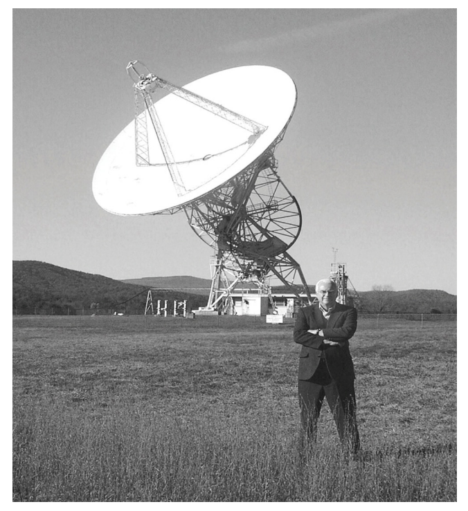
Figure 2. Frank Drake in front of the NRAO 85-foot Howard E. Tatel telescope that he used for Project Ozma.

Drake found he "could reduce the whole agenda for the meeting to a single line" (Drake & Sobel, 1992). That line was