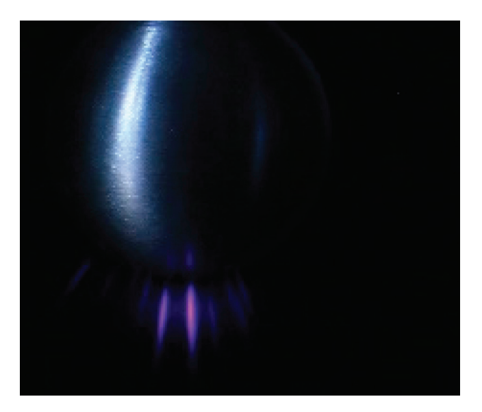
Figure 1. Direct-current corona discharge of negative polarity on a spherical surface, showing a stage with few moving streamers in blue to purple colours (from Riba et al., 2018, p. 10, fig. 4a left).