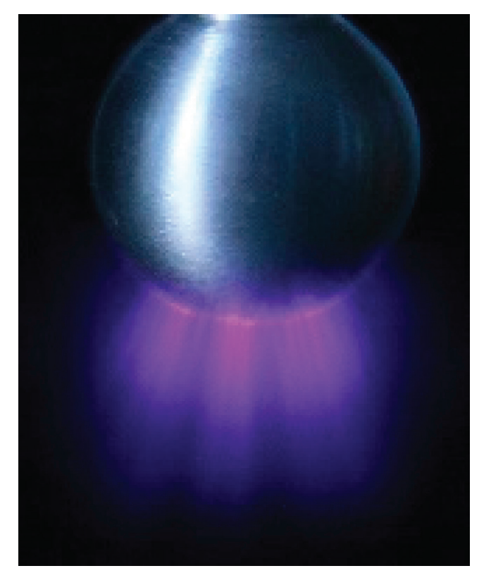
Figure 2. Direct-current corona discharge of negative polarity on a spherical surface, showing a stage with an amalgam of moving streamers blurring into a broad glow in blue to purple colours (from Riba et al., 2018, p. 10, fig. 4b).

Figure 1. Direct-current corona discharge of negative polarity on a spherical surface, showing a stage with few moving streamers in blue to purple colours (from Riba et al., 2018, p. 10, fig. 4a left).